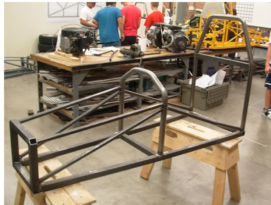
Isometric view as of 10/01/2010

Next Few Weeks: In the upcoming weeks it will be crucial to find a better way of communicating between both parts of our team. We will continue working hard to get closer to the completion of the chassis which includes redesigning the back-end and rear axle of the car in Inventor. We are also anxious to hear back from our possible sponsors and plan on changing our name in support of our sponsor.